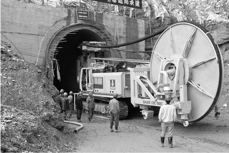
Figure 1: Bauer Low Headroom Trench Cutter [1]

technology. Throughput and desanding capacity have to be closely matched with the soil and the cutter performance.